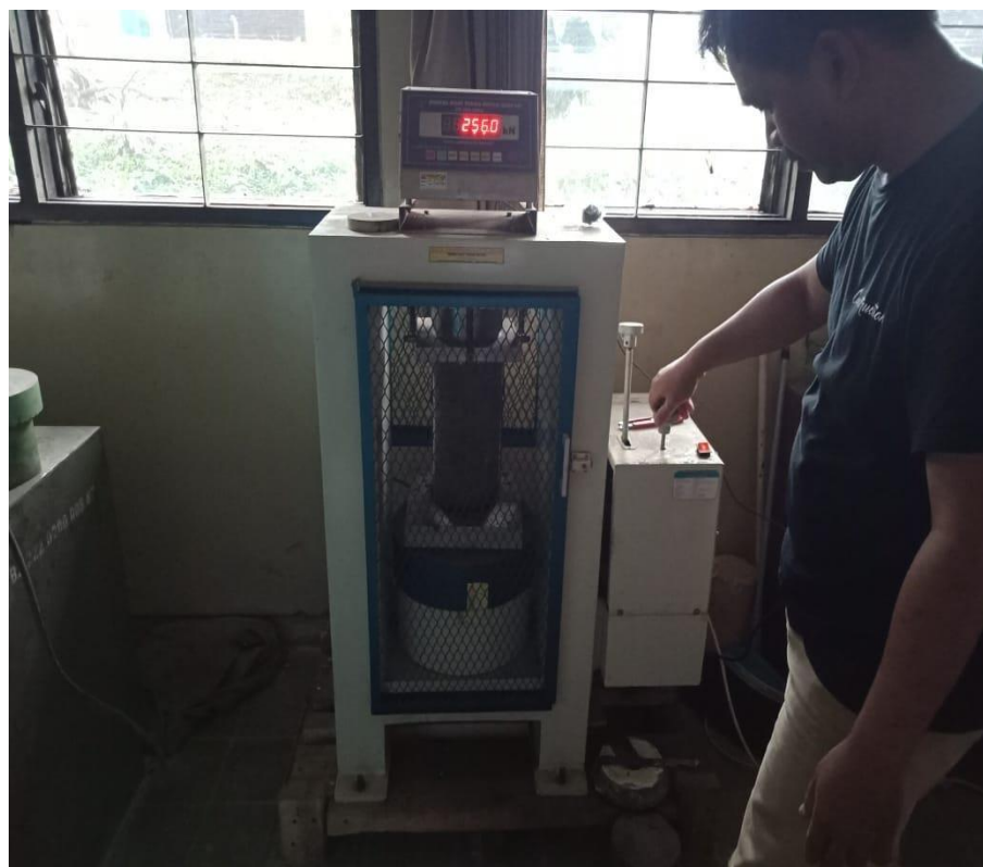
Figure 4. Concrete compressive strength test simulation

Testing the compressive strength of concrete using a tool as simulated in Figure 4 .