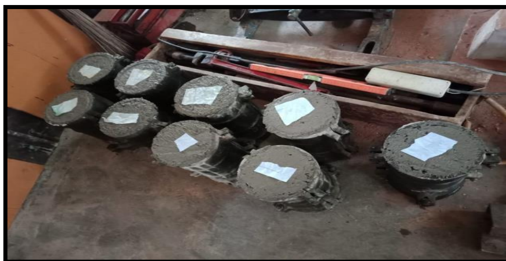
Figure 2. Concrete test objects

The procedure for making test specimens is to select the portion of the concrete mixture used in the test for molding of the specimen in such a way that it represents the actual comparison and conditions, when the concrete is not being stirred or a test sample is taken, cover it to avoid evaporation. Print the test object as close as possible to the storage area for the first 24 hours. If it is not possible to print the specimen near the storage area as soon as possible after leveling, place the mold on a rigid surface, free from vibration and other disturbances. Avoid collisions or scratches on the surface of the test object when transferring the test object to the storage area. To avoid evaporation of water from unhardened concrete, cover the specimen immediately after finishing work, preferably with a non-absorbent and non-reactive slab or a strong, durable, water-resistant plastic sheet. Description of the manufacture of the test object as described in Figure 2 .