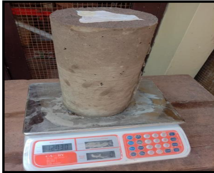
Figure 3. Weighing of test object

All test objects are weighed as simulated in Figure 3 . Each variant of the composition of the concrete mixture is made 9 test objects. In this study, there were 3 variants of mixed composition so that there were as many as 27 test objects. The weight of the test objects of each variant is described in Table 6 .